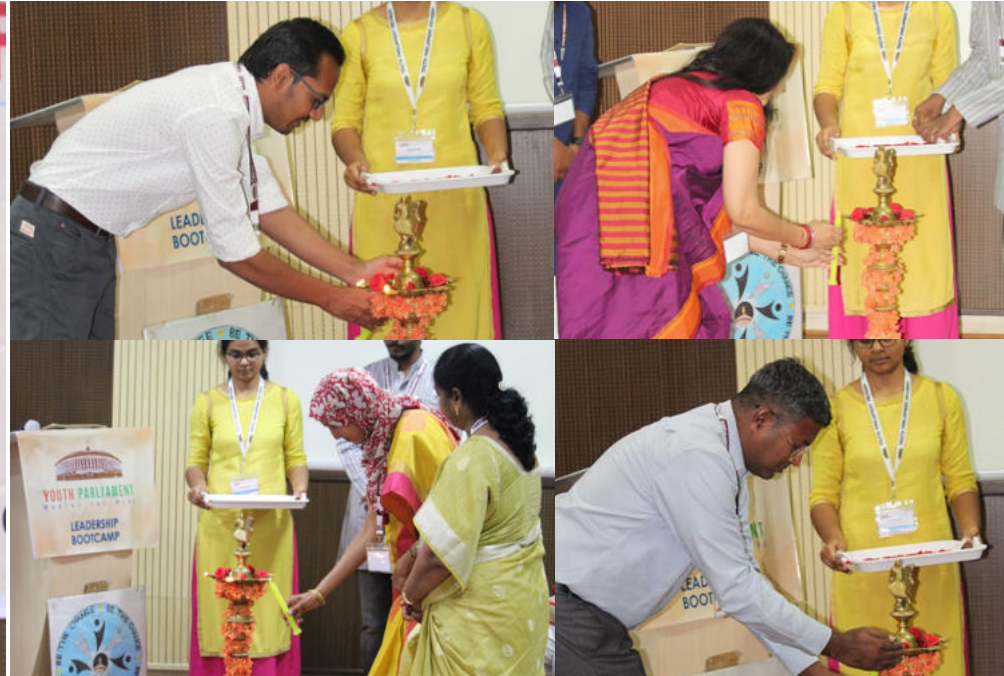
Lamp Lighting Ceremony.