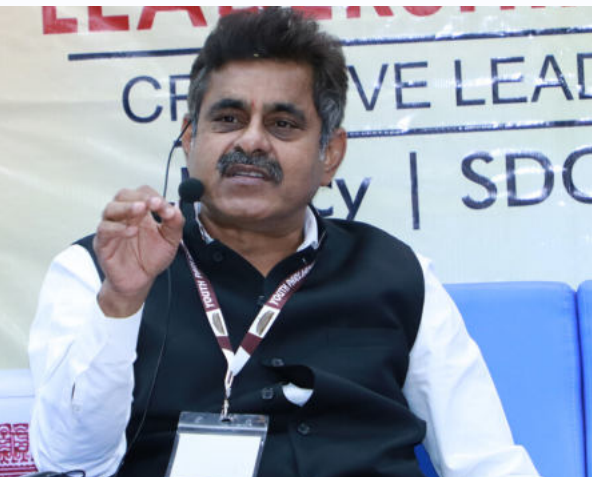
Shri. Konda Vishweshwar Reddy, Former Member of Lok Sabha