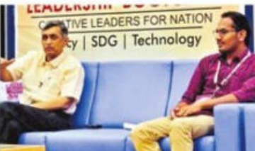
మాట్లాడుతున్న జయప్రకాష్ నారాయణ్

నిజాంపేట, ఫిబ్రవరి 23 (ఆంధ్రజ్యోతి): నిజాంపేట వీఎన్ఆర్ విశేషకళలో మూడు రోజుల పాటు యూత్ పార్లమెంట్ అధ్యక్షులలో జరిగిన లీడర్ షిప్ బూట్ కార్యక్రమం ఆదివారం ముగిసింది. చివరి రోజు కార్యక్రమానికి వీ అండ్ షీ సంస్థ ప్రతినిధి