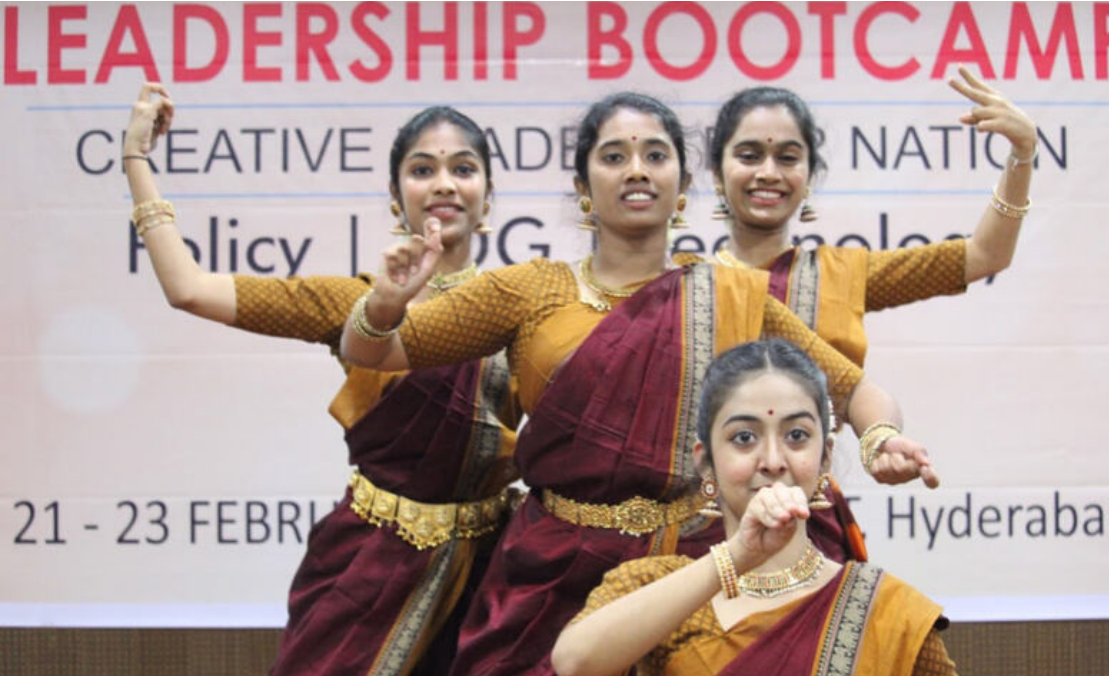
Traditional Bharatanatyam Dance