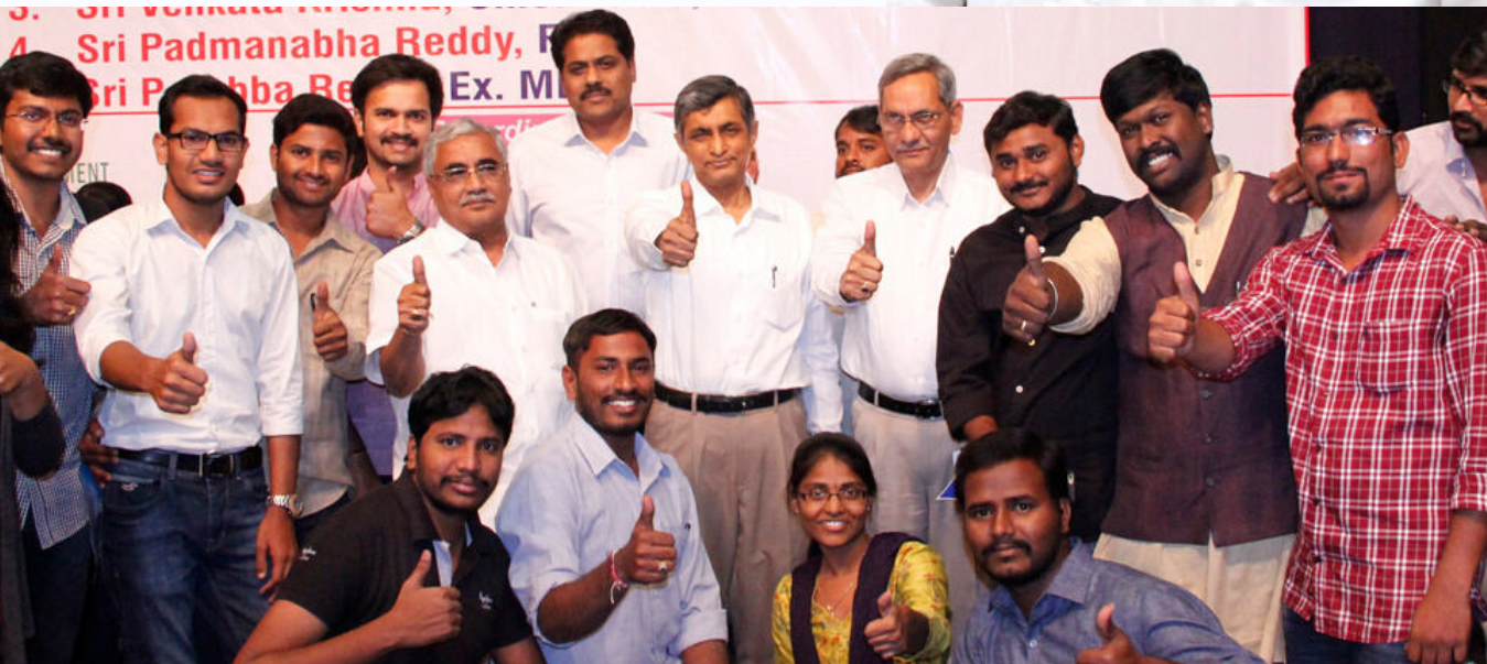
Youth Parliament Program Team

The platform will inspire the youth to express their views in an organized way. It will also allow for the emergence of bright future leaders.