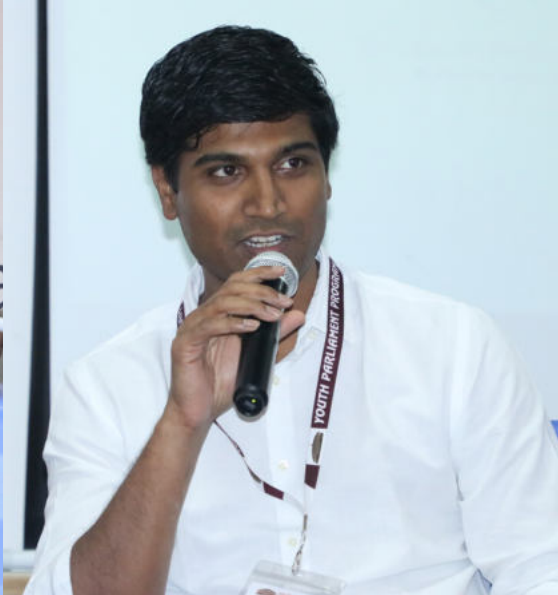
Shri. Lavu Sri Krishna Devarayalu, Member of Parliament, AP, YSRCP