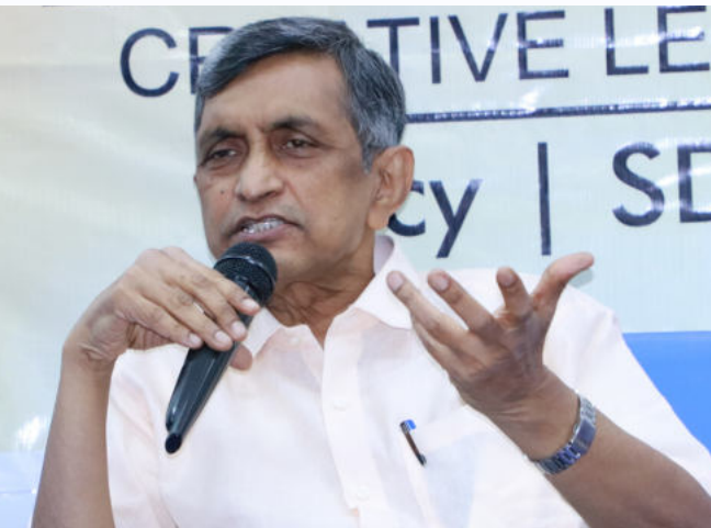
Shri. Dr. Jayaprakash Narayan

General secretary, Foundation For Democratic Reforms & Advisor Youth Parliament Program